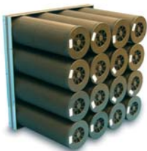
6. Camsorb Canisters

As part of our continuous improvement, Camfil Farr reserve the right to change specifications without notice.