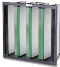
2. Opakfil Green F8