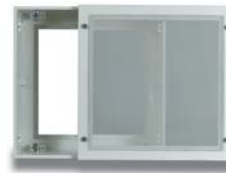
9. Sofdistri Exhaust

As part of our continuous improvement, Camfil Farr reserve the right to change specifications without notice.