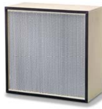
3. Soflair H13