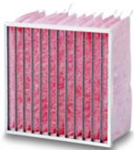
1. Hi-Flo F7