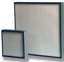
6. Megalam MDA