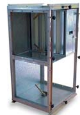
4. FC-Filter Casing