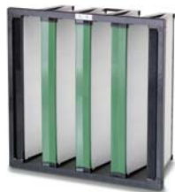
2. Opakfil Green F8/E10