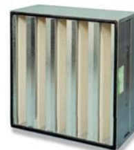
4. Sofilair H13/H14