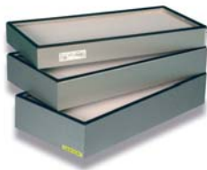
7. Megalam MX MG