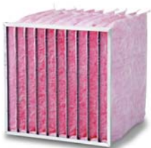
1. Hi-Flo F7/F8