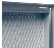
8. Megalam U

As part of our continuous improvement, Camfil Farr reserve the right to change specifications without notice.