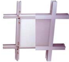
7. CamGrid SM 20