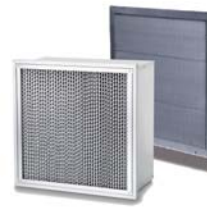
4. Airopac HT/Panolair HT