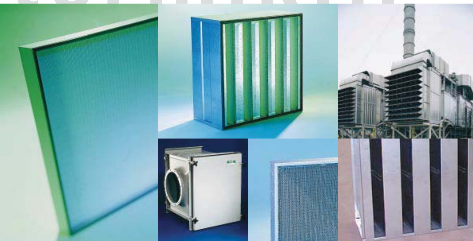
Filter products from left to right: Midilam (ULPA filter) Sofilair (HEPA filter, above), Cambox, Termikfil (high temperature filter), turbo machinery plant and Gigasorb (for AMC).