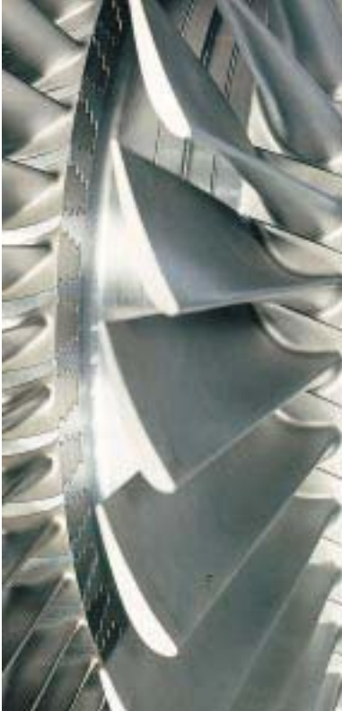
Camfil Farr provides air filtration solutions to keep sensitive environments clean, to increase their operation efficiency and to protect the equipment.

A few uncollected particles or gas molecules can have extremely serious consequences in some processes. Just imagine what harm contaminated air could do to the manufacture of semiconductors, pharmaceuticals and to other sensitive processes.